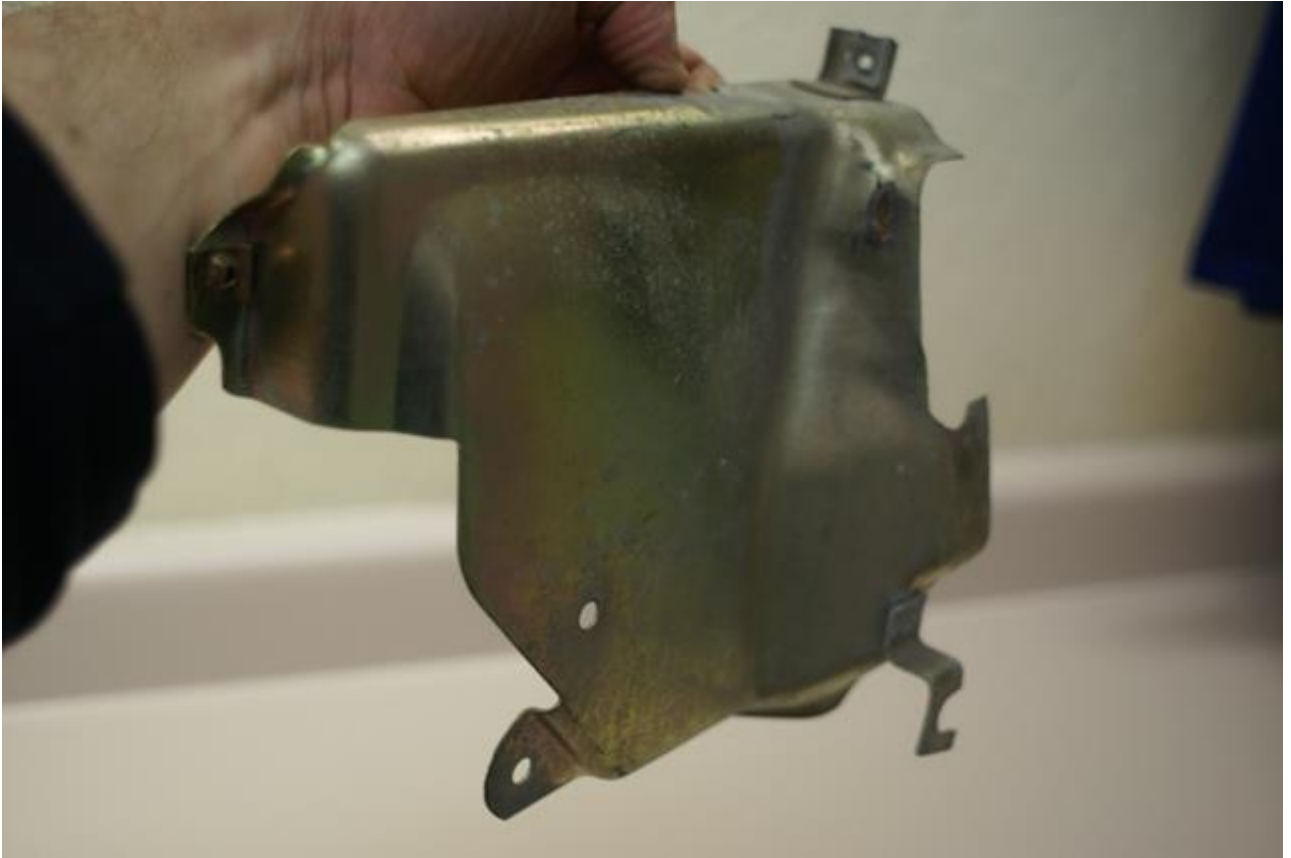
Showing the rear hook that goes on the bolt head: