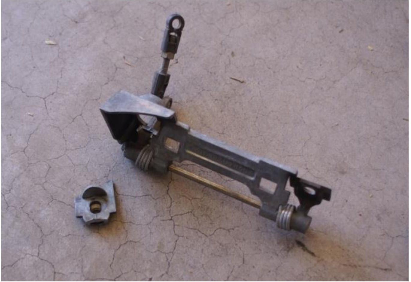
Here are the handle ends in situ: