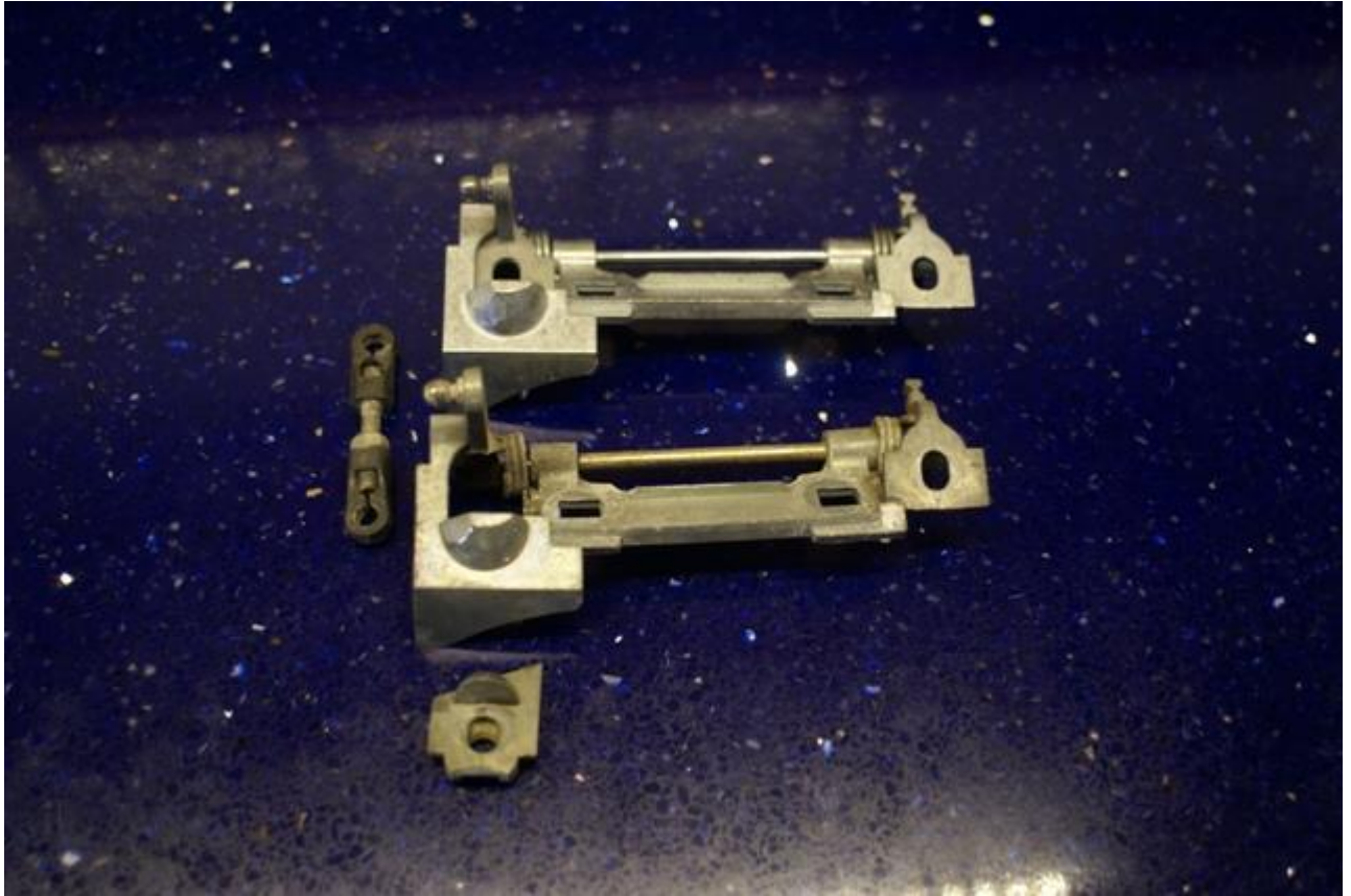
Heres the handle removed from its natural habitat: